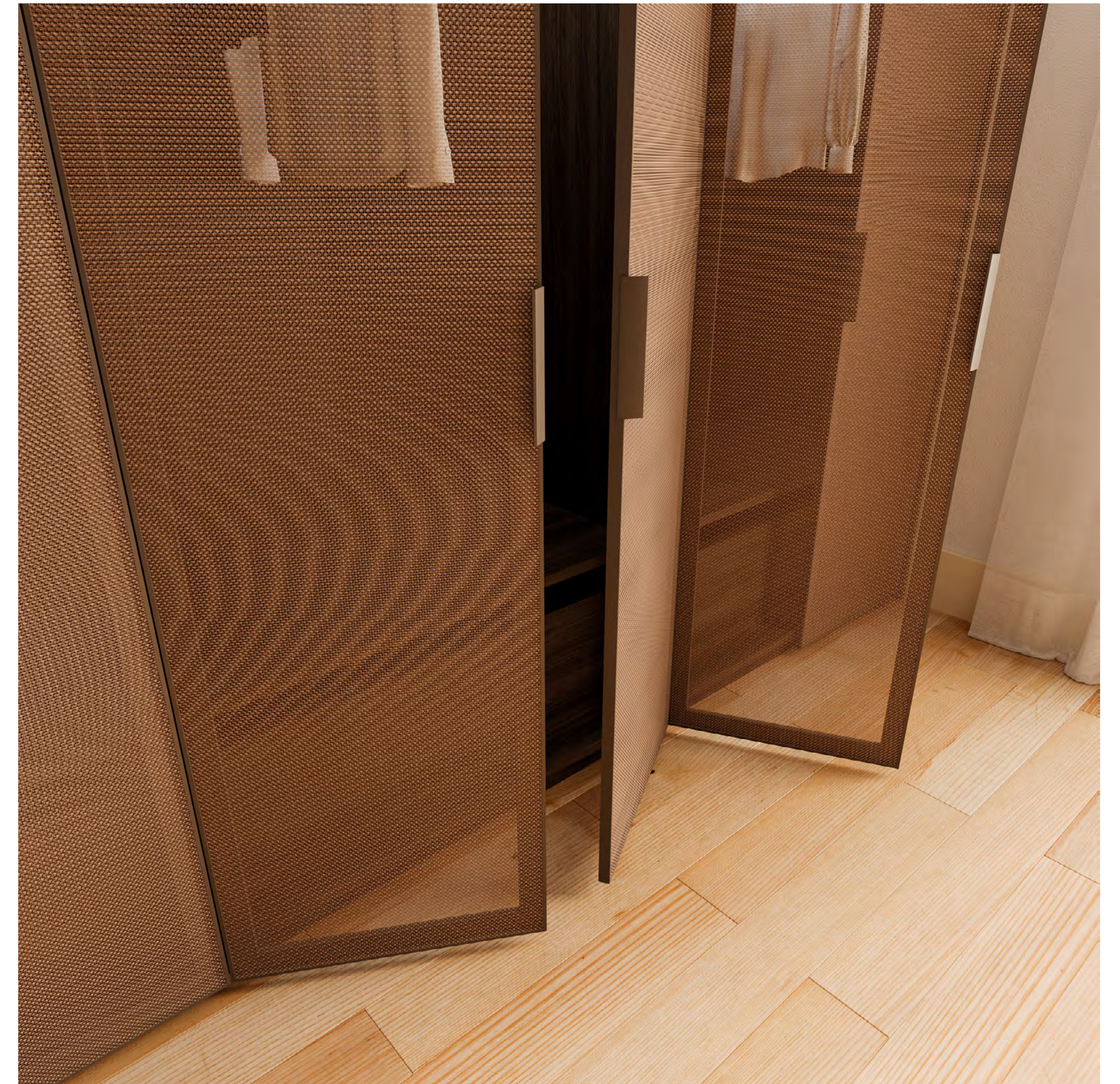
Fine craftsmanship. Glass doors lined with natural grass-root.