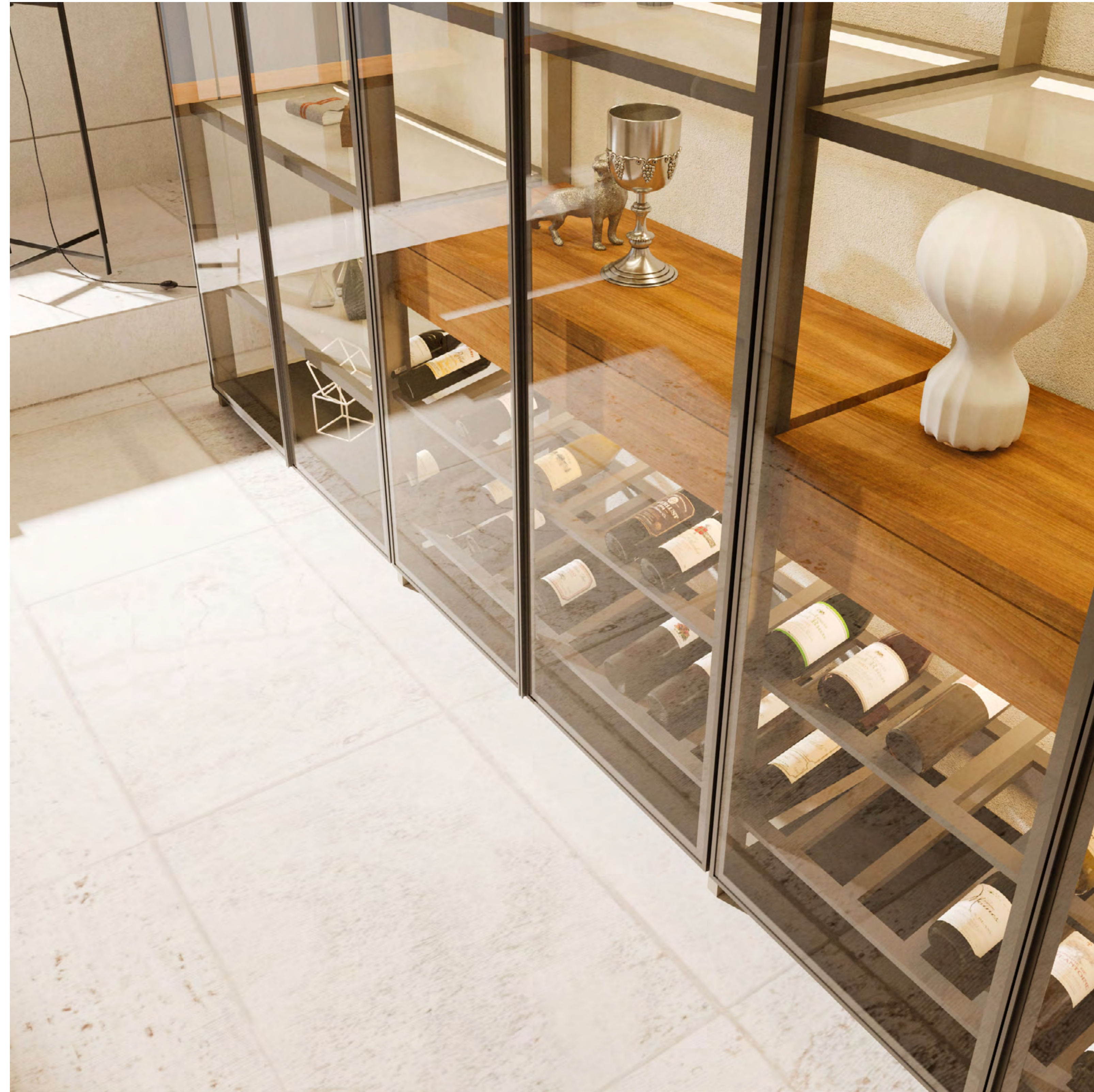
One of the most popular styles today: multifunctional design