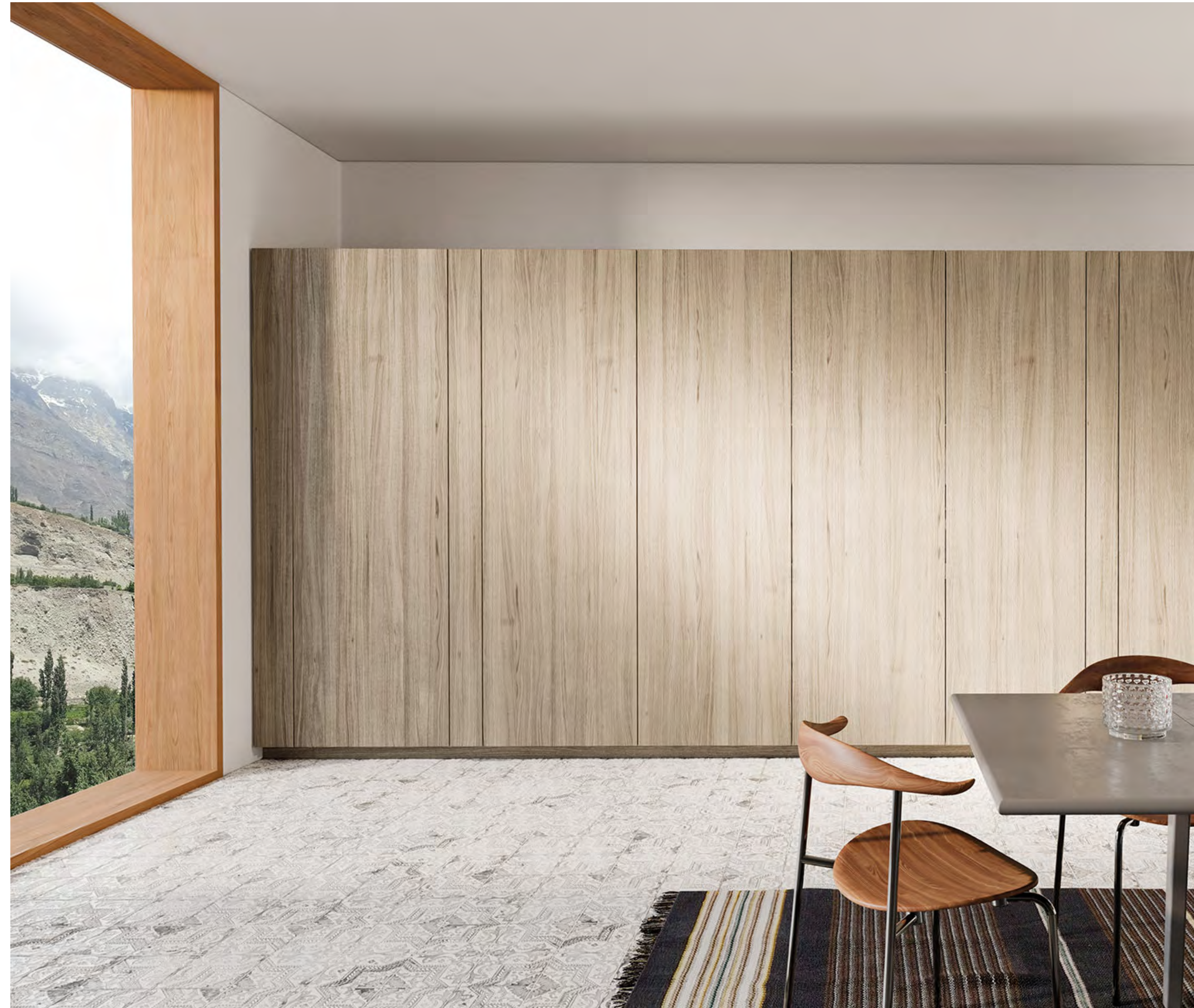
Design reflected in a beautiful solution.