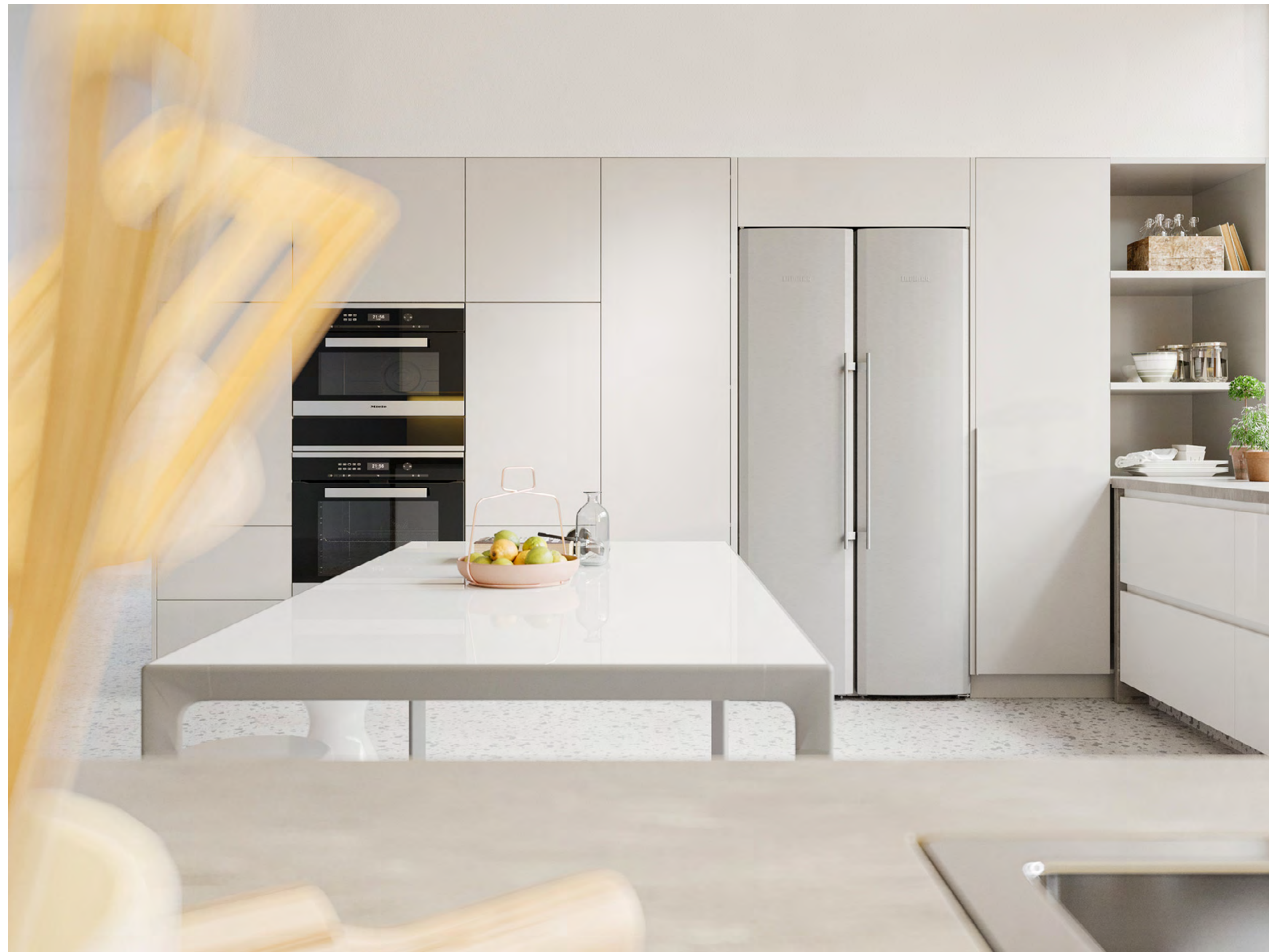
Your kitchen can be so irresistible!