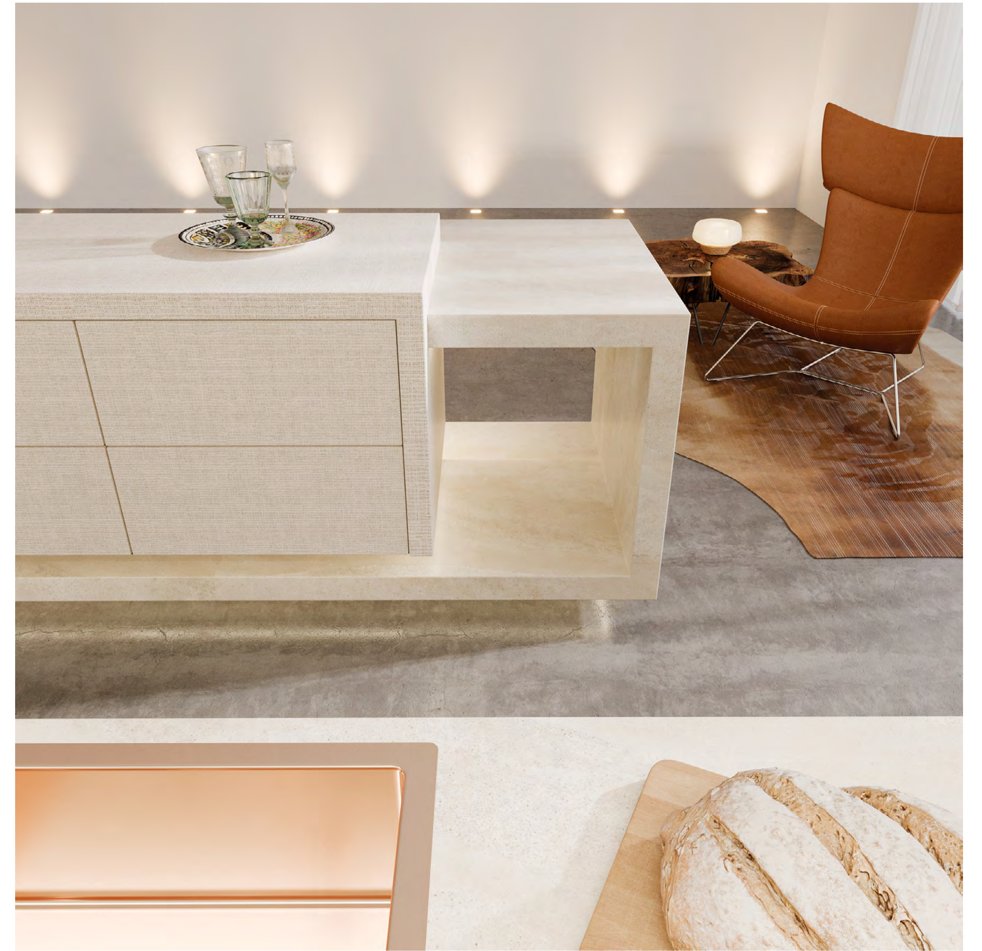
The brightness is exposed in all its purity in the geometric cuts.