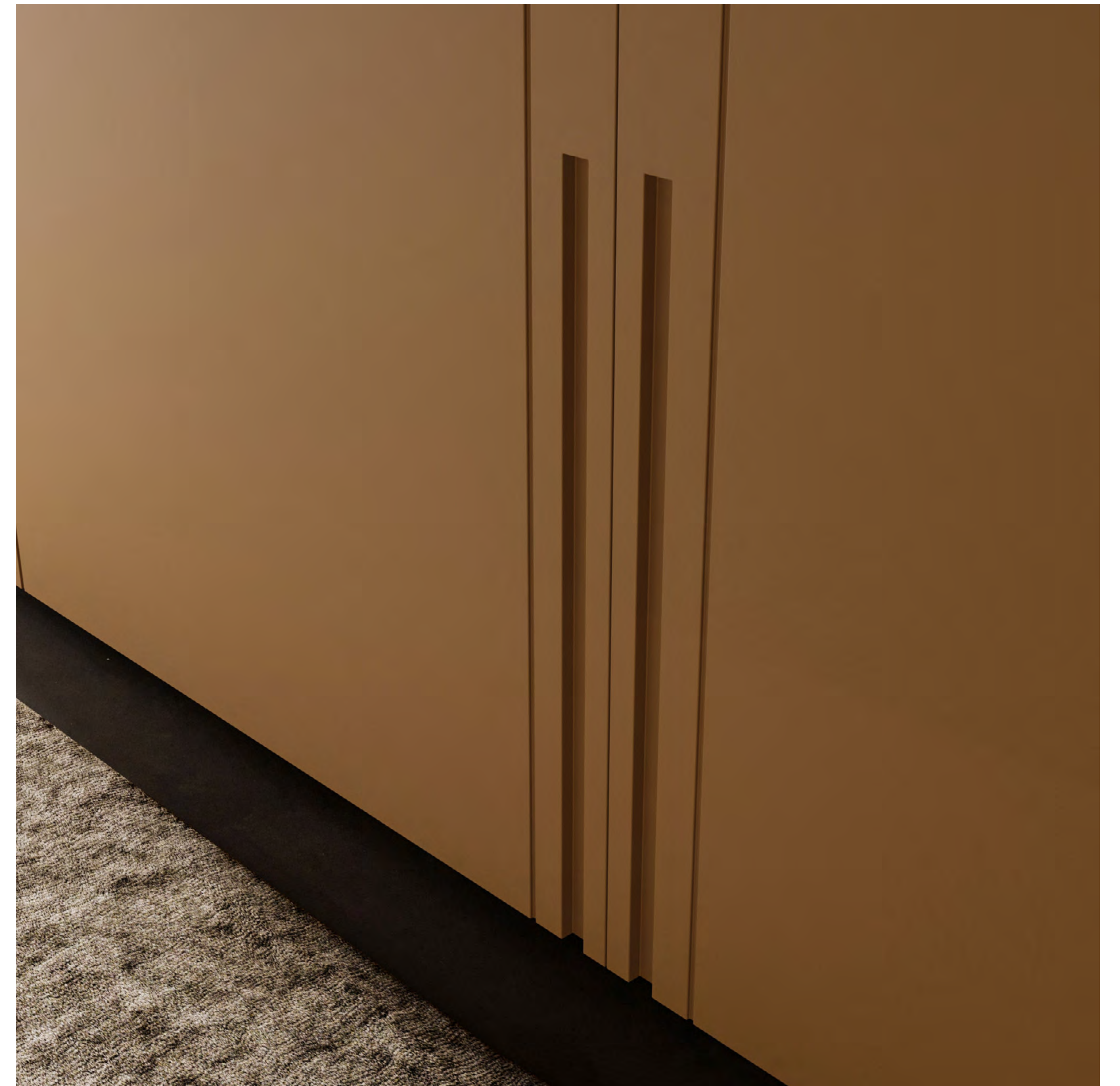
Elegance with versatility. Infinite composition of colors and handles.