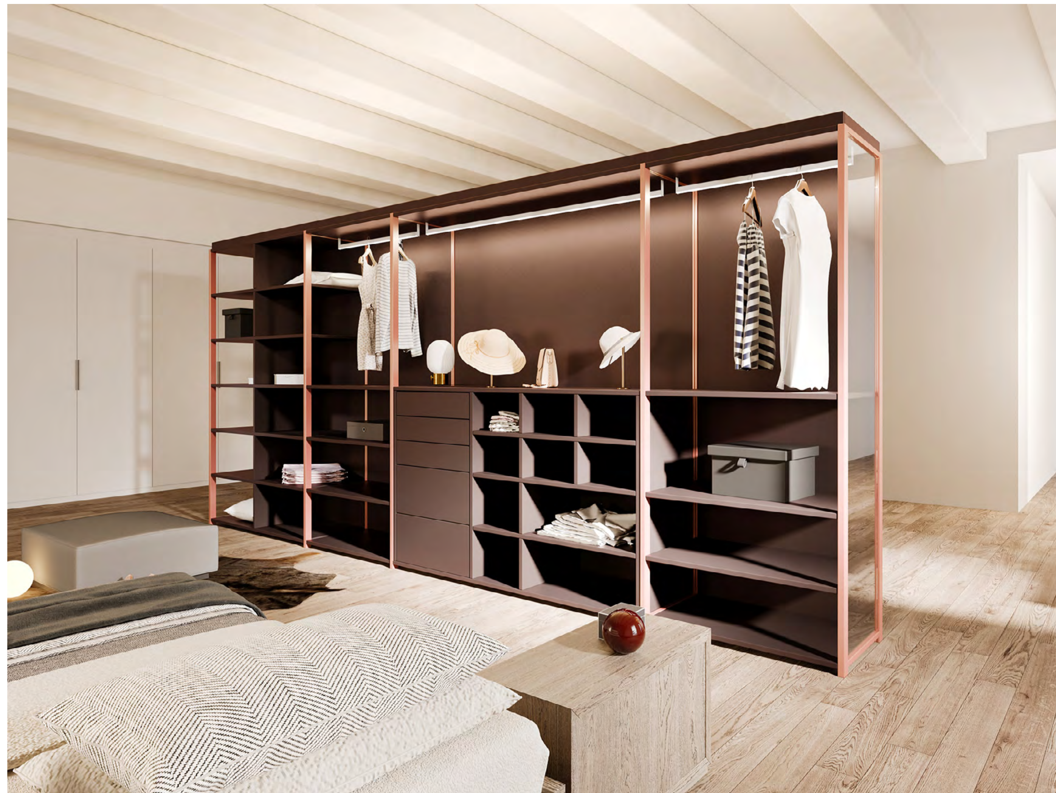
Boldness and authenticity set the tone in space with strong visual allure.