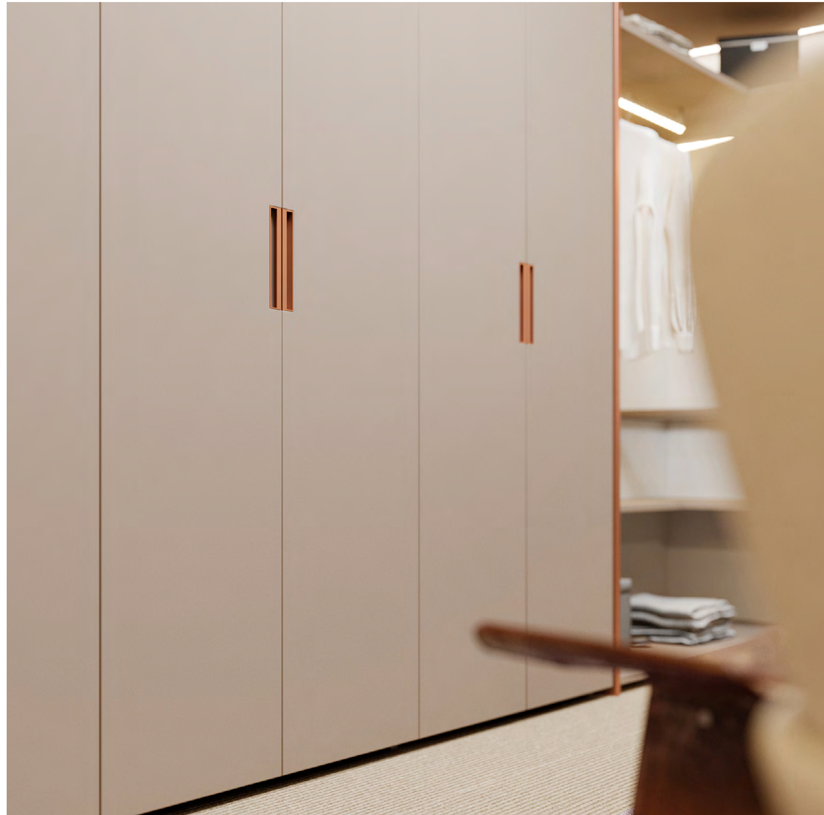
The golden-rose is inspired in the details of an elegant and contemporary environment.