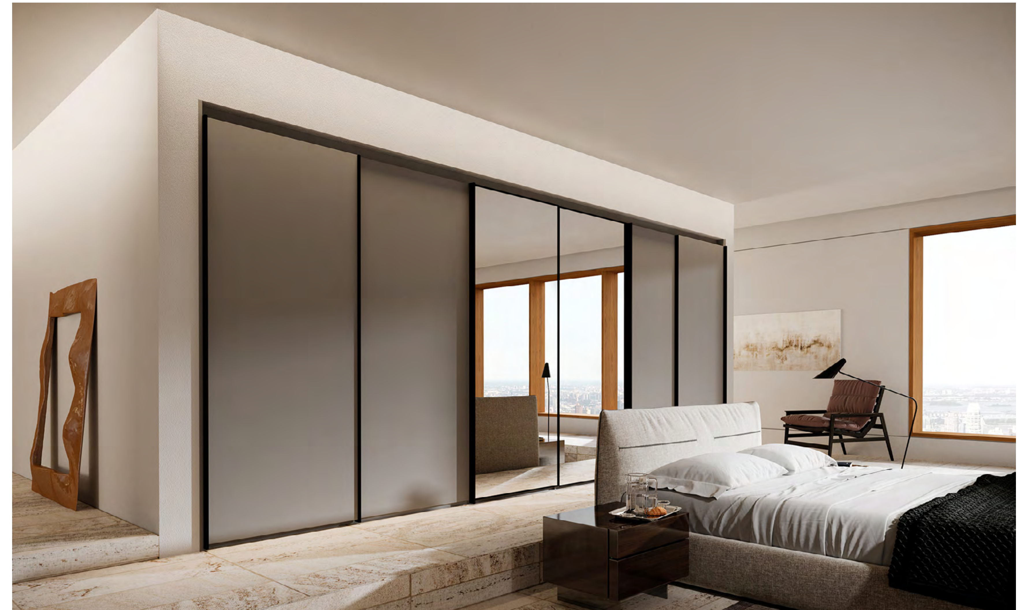
Inspired with the details and lightness of its design