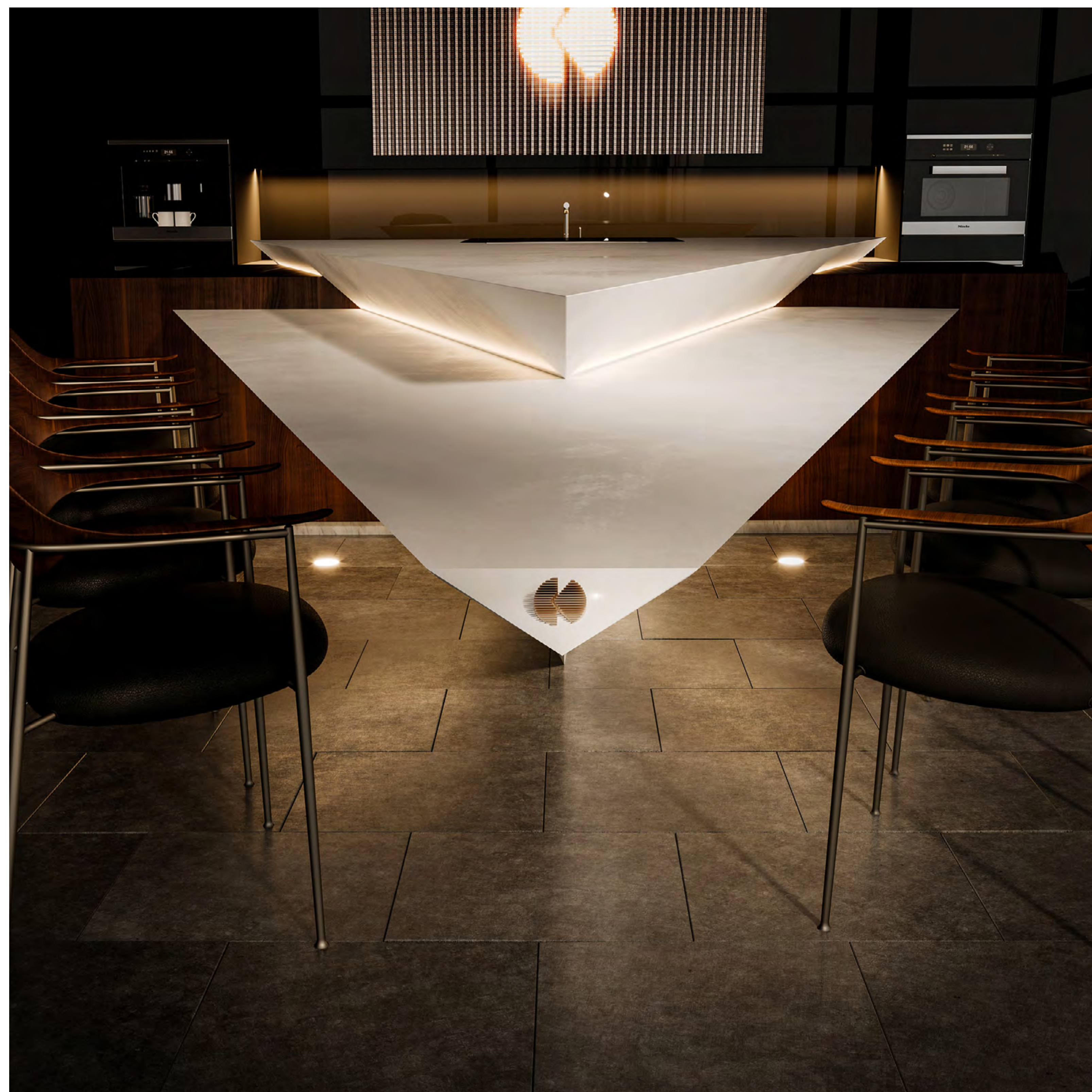
The elegance of dark tones takes on new meanings in its futuristic version.