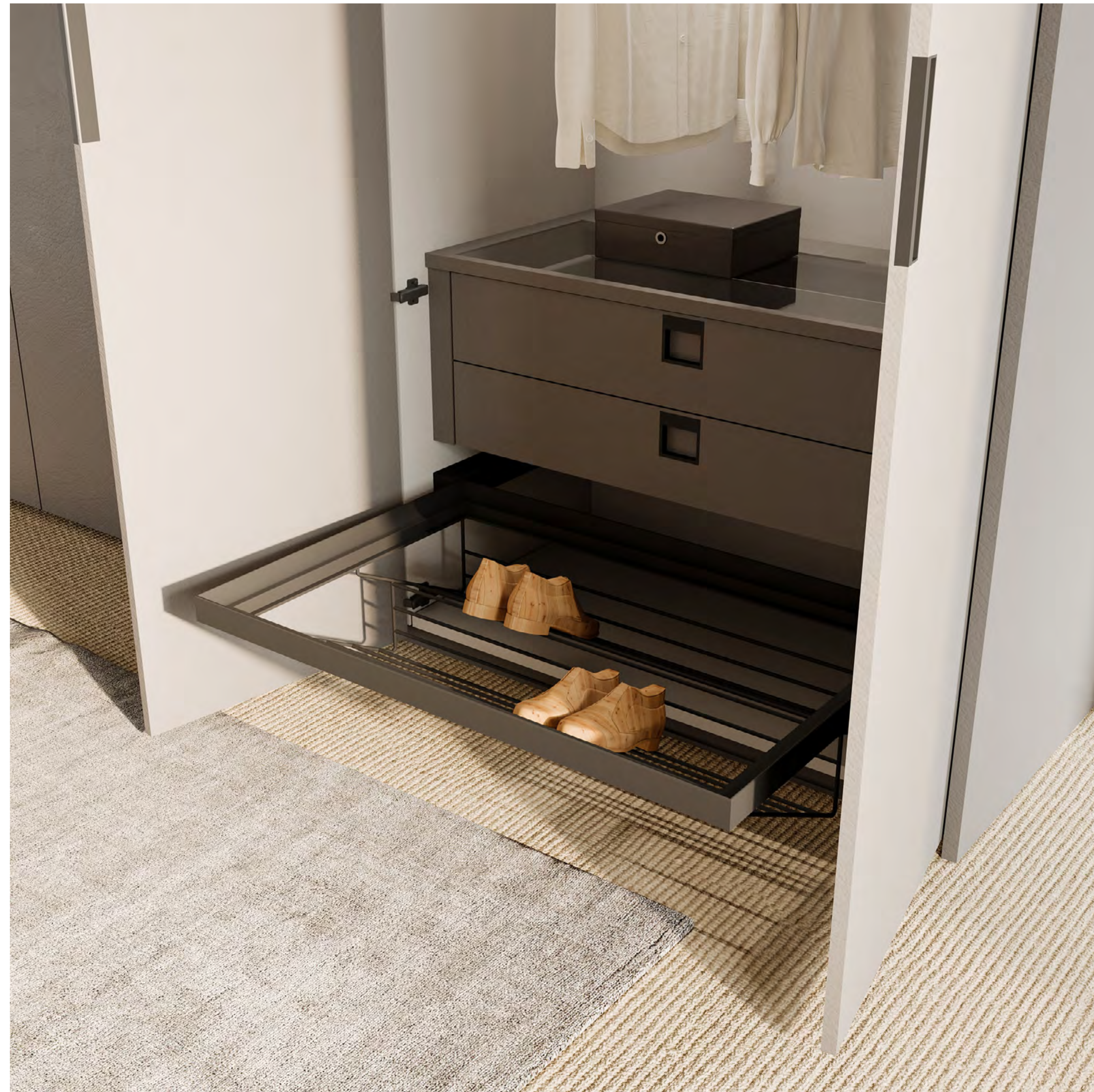
Charm in light and fluid lines